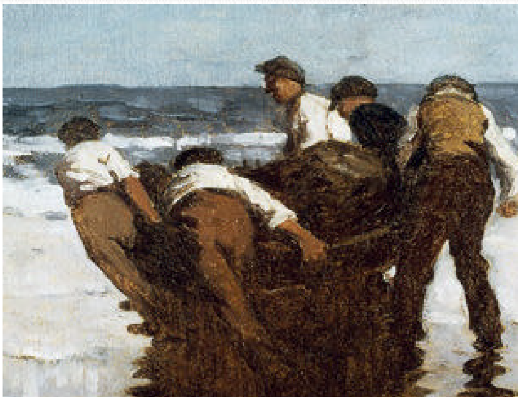
Paul Henry: Launching the Curragh

education begins from the child's own experience. In looking at the work of artists we need, therefore, to begin with children's visual knowledge and experience. We would suggest the following as a useful framework for thinking about classroom activities in this area of the curriculum: